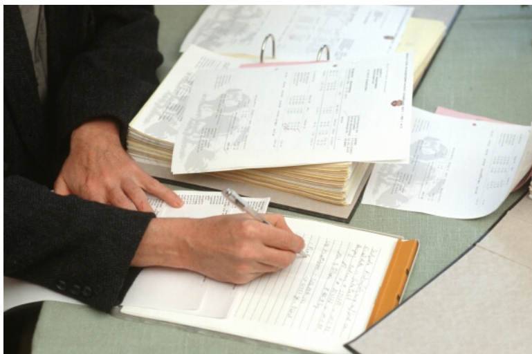
Fig.: Inspector checks the business records

After the inspection an inspection protocol is drawn up and signed by the inspector and the responsible person from the company. The inspection body writes an inspection report if necessary with references and instructions and sends it to the company. After successful inspection the operator receives an organic certificate that can be communicated to the guests and clients.