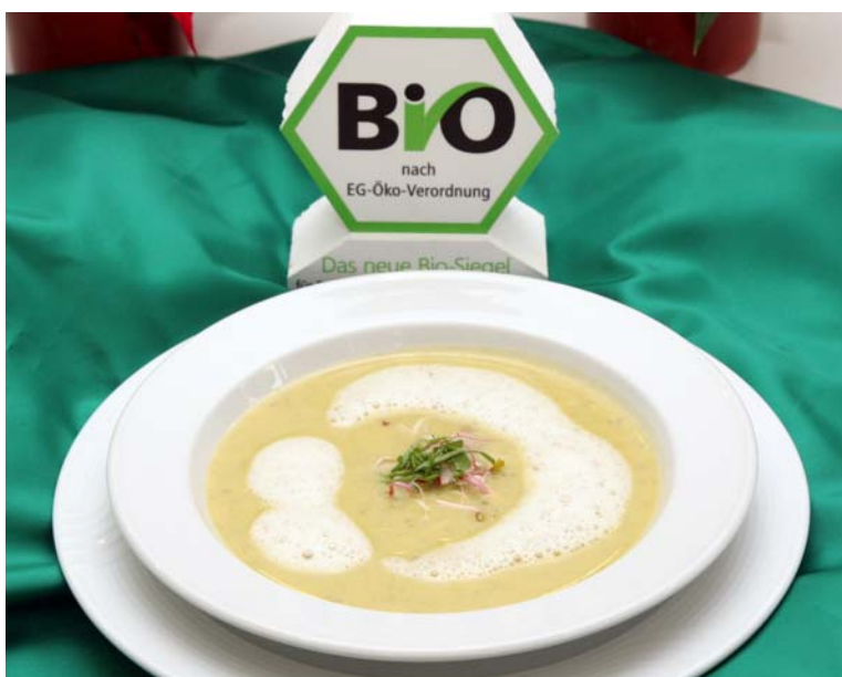
Fig.: Organic Hamburg Parsley Soup

The disadvantage of an organic dish variation lies in the supply and the danger of confusion. All ingredients including spices and frying fats must be used in certified organic quality.