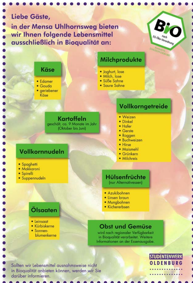
Fig.: Poster in a student canteen about the use of organic ingredients