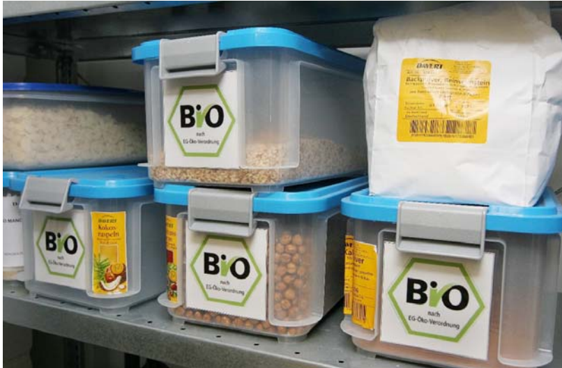
Fig.: Organic goods in a dry storage room