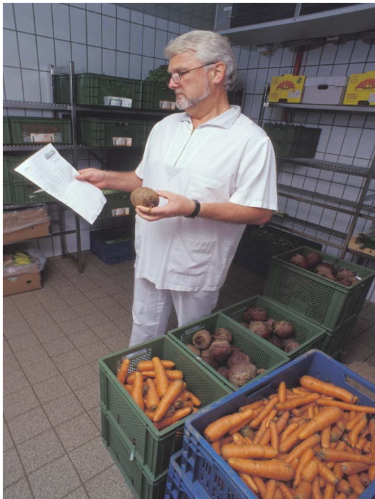
Fig.: The kitchen manager inspects a delivery from an organic wholesaler

The examination of incoming goods is a good professional practice in the foodservice sector. The use of organic products adds a few minor requirements: the supplier needs a valid certificate from an organic inspection body. The supplier also has to indicate clearly all organic products on the delivery note and on the invoice. The delivered goods must also be clearly labelled with the name and address of the supplier, the product name with organic indication (e.g. 'organic lemons') and with the code of the inspection body which is responsible for the supplier [in Germany: DE-XXX-Öko-Kontrollstelle]. The inspected and signed delivery order is then filed e.g. in a folder. Such documentation is taken into account during inspections.