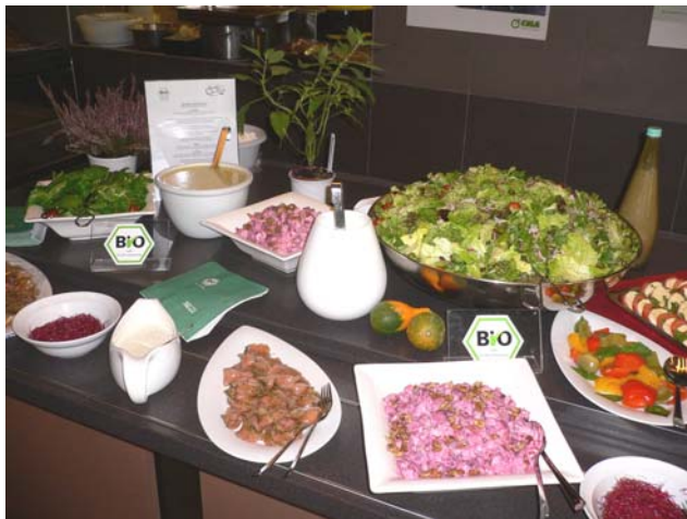
Fig.: Labelling of the vegetable buffet

The advantage of the organic component variation is that the kitchen has more flexibility in its menu design, there are also advantages in procurement and possibly in storage. This variation is especially popular and sensible in businesses with a free-flow canteen setting.