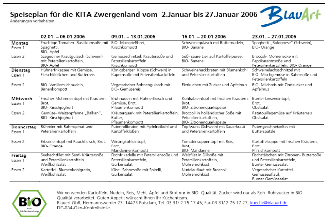
Fig.: Menu of a catering company with indication of organic products