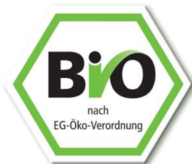
Fig.: Current German organic logo

In May 2001 an official organic logo [German: Bio-Siegel] was created in Germany. It was initiated by the then Federal Minister of Consumer Protection Renate Künast and agreed upon by an alliance of trade, organisations and politics. It is protected as a trade mark and it can be used by all producers, processors and the trade sector to label organic food that was produced according to controlled standards of the EU Regulation on Organic Farming. The Bio-Siegel Information Centre was founded to help users with a fast and non-bureaucratic market launch of the organic logo.